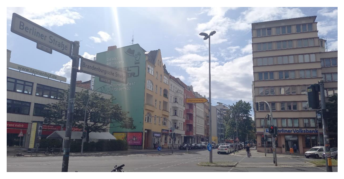
Junction of Berliner Street and Brandenburgische Street

This will bring you in front of the Sparkasse building. Walk straight for about 20 meters to the intersection of Berliner Street/Brandenburgische Street and cross it. Note: The traffic light phase is very short, so you might need to wait at the pedestrian island for the next green light. Follow the path for about 70 meters.