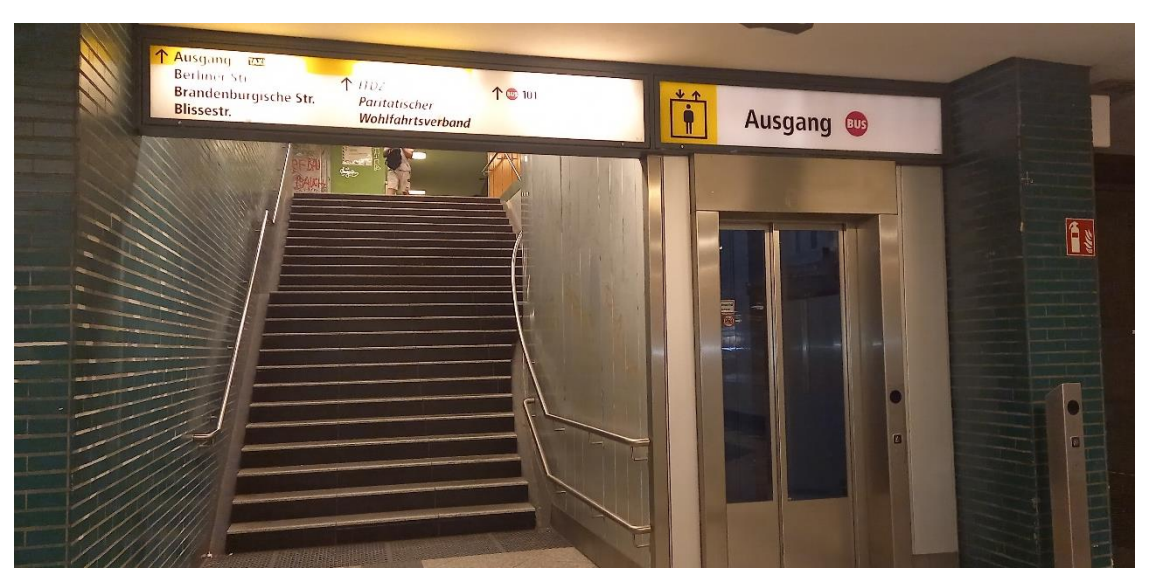
Staircase and elevator at U-Bahnhof Blissestraße

In the direction of travel (Spandau) of the U-Bahn, there is a staircase and an elevator at the front of the platform. The elevator is located to the right of the stairs. Walk up the stairs and then turn right towards the exit "Brandenburgische Straße/Berliner Straße/Deutscher Paritätischer Wohlfahrtsverband/Dietrich-Bonhoeffer-Bibliothek" to the next staircase.