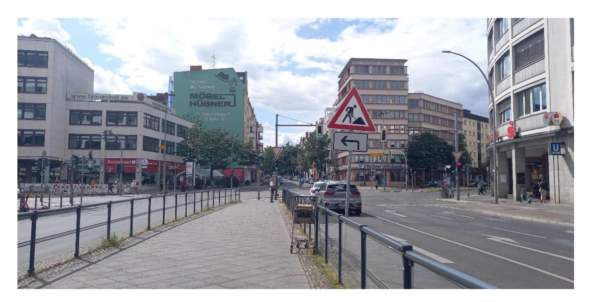
Elevator Exit U-Bahnhof Blissestraße

Turn 90 degrees again to cross the intersection Berliner Str./Brandenburgische Str.. Please note: The traffic lights are very short, which is why you can wait on a pedestrian island at the halfway point for the next green phase.