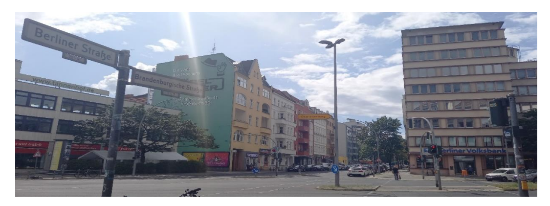
Junction of Berliner Street and Brandenburgische Street

This will bring you in front of the Sparkasse building. Walk straight for about 20 meters to the intersection of Berliner Street/Brandenburgische Street and cross it. Note: The traffic light phase is very short, so you might need to wait at the pedestrian island for the next green light. Follow the path for about 70 meters.