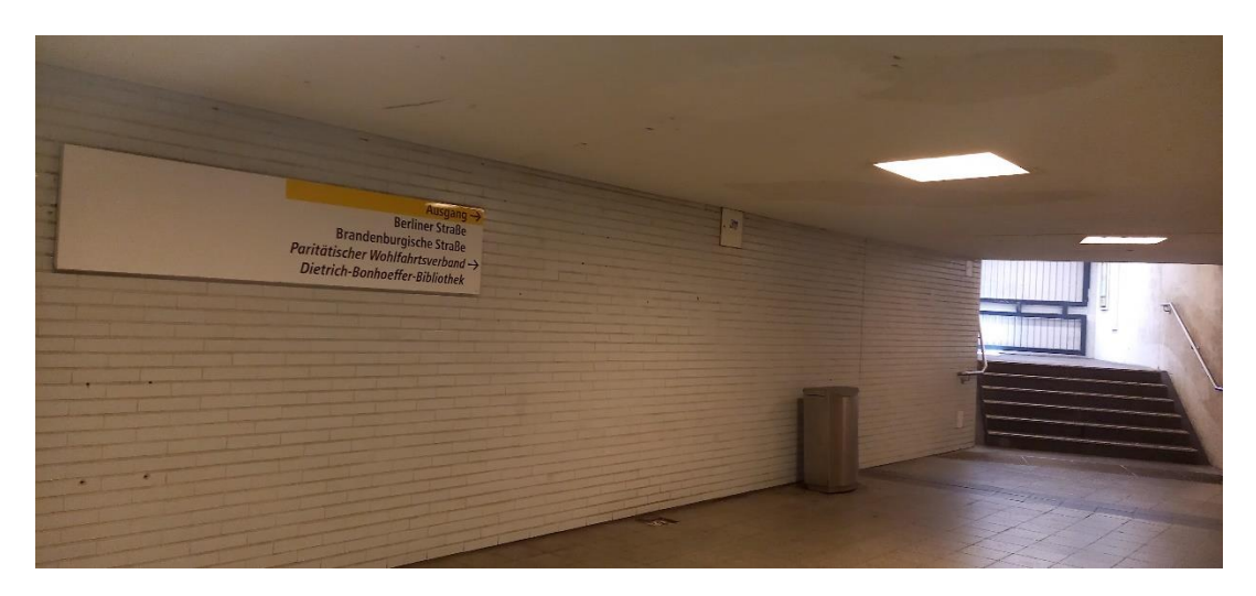
Exit of U-Bahnhof Blissestraße

This will bring you in front of the Sparkasse building. Walk straight for about 20 meters to the intersection of Berliner Street/Brandenburgische Street and cross it. Note: The traffic light phase is very short, so you might need to wait at the pedestrian island for the next green light. Follow the path for about 70 meters.