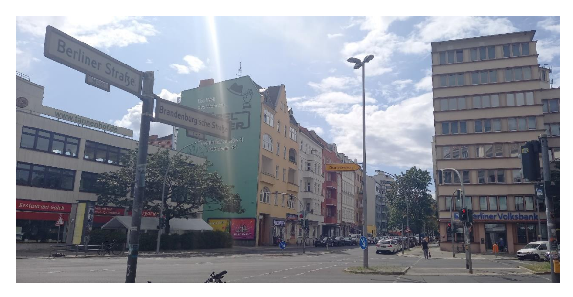
Junction of Berliner Street and Brandenburgische Street

Turn 90 degrees again to cross the intersection Berliner Str./Brandenburgische Str.. Please note: The traffic lights are very short, which is why you can wait on a pedestrian island at the halfway point for the next green phase.