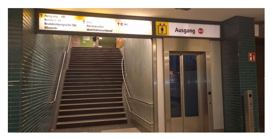
Staircase and elevator at U-Bahnhof Blissestraße

In the direction of travel (Rudow) of the subway, a staircase and an elevator lead up at the back. The elevator is located to the right of the stairs. Walk up the stairs and then turn right to the exit "Brandenburgische Straße/Berliner Straße/Deutscher Paritätischer Wohlfahrtsverband/Dietrich-Bonhoeffer-Bibliothek" to the next staircase.